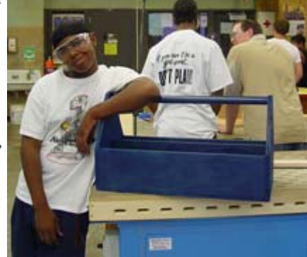
"Check out my cool toolbox."

On August 1<sup>st</sup>, a completion ceremony was held, and parents, friends and family members all joined in the celebration. Students showed off their work, which included the construction of stepping-stones, stairs, and toolboxes and the framing of a shed. One parent, in particular, was so delighted by what her son had learned that she was going to put him to work the rest of the summer